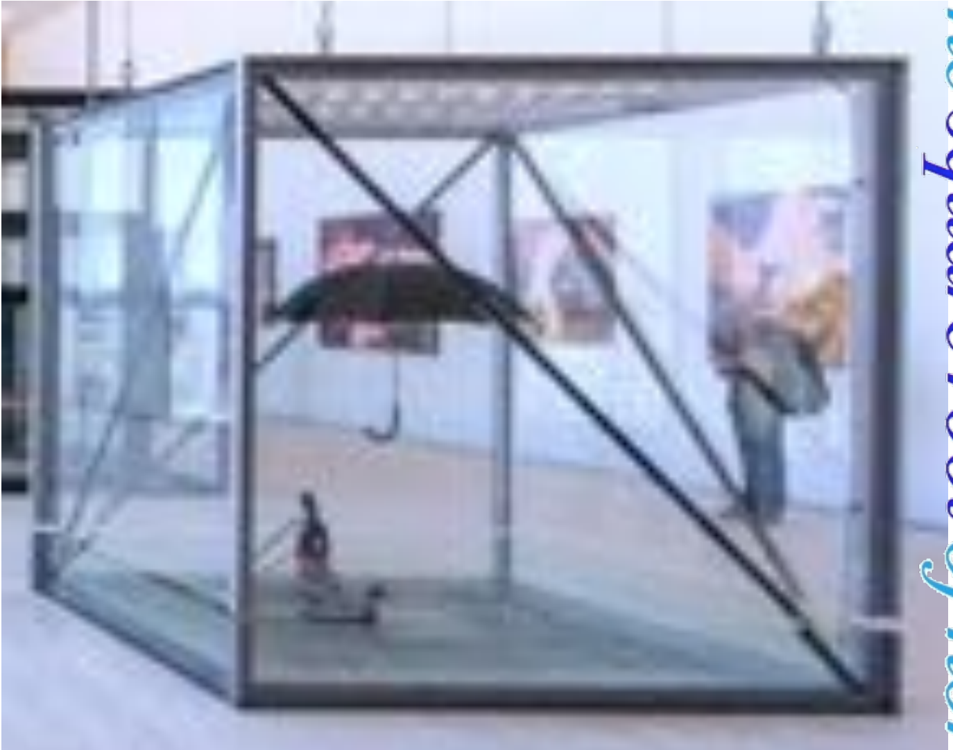
Prada Foundation, Milan